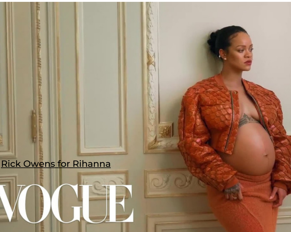
Rick Owens for Rihanna